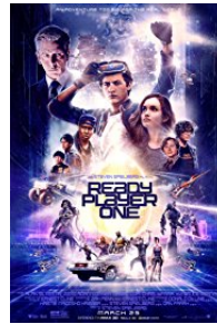
READY PLAYER ONE 4/10

Don't miss the next Sensory Friendly Film!