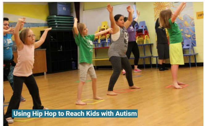
Using Hip Hop to Reach Kids with Autism