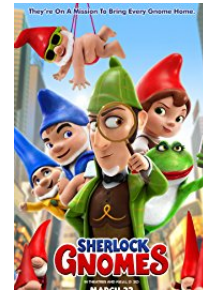
SHERLOCK GNOMES 4/14